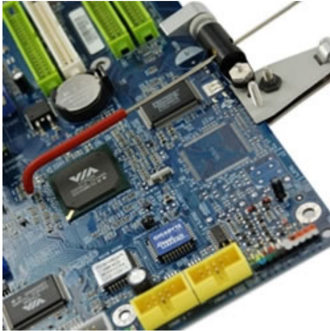
Figure 5: The Temprobe™ has been newly redesigned to handle the high process requirements of Lead-Free.

expressly to provide quick, reliable temperature readings on any type of surface.