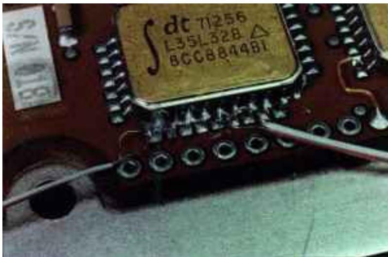
Figure 2: Adhesive Thermocouple Attachment

There are two general classes of material commonly used to adhesive bond thermocouples. One is accelerator or UV activated adhesives that set in seconds, but are only rated for around 120°C. They do not hold up well in reflow, and are more commonly used for wave solder applications. Special high temperature, two part epoxies are rated up to 260°C, but require several hours at elevated temperature to cure.