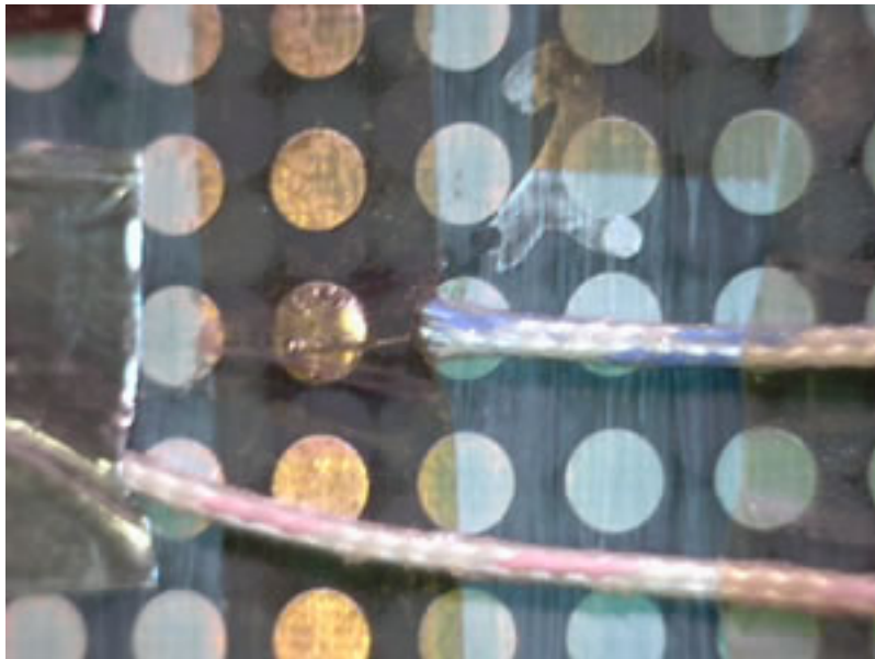
Kapton* Tape Thermocouple Attachment

The alternatives, heat dots or crayons, IR sensors, or guessing, each have drawbacks. Heat dots or crayons show only the peak temperature they experience, (usually in unsuitably large 5 to 10°C increments), with no indication of the heating rate or time at temperature. They also can distort the heat absorption of the test area they cover, particularly if there is a significant component of radiant heating. IR sensors require careful adjustment for the emissivity characteristics of each different surface they must monitor. This is often done by carefully instrumenting the critical points on the board with thermocouples, then re-measuring each point with an IR sensor, and adjusting the corresponding readings to match. Also, the field of view may take in surfaces other than the one to be measured (example: the bare board surrounding a pad). Finally, if the board must be removed from the heat source to be IR monitored, the indicated temperatures will be a function of how long it has been away from the heat source.