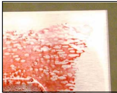
Fig. 3: Oil clumps and lifts as a result of surfactants

The combination of water, solvents, surfactants, and saponifiers can be as effective as solvent cleaning, but often requires a change in the cleaning process. In a high precision application where residues cannot be tolerated, a rinsing process is often required with water-based chemistries. Batch or in-line cleaning systems generally have rinse and dry cycles to overcome these issues.