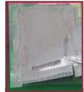
Step 4- Pull stencil off, lifting stencil from PCB