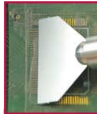
Step 3- Roll solder paste into apertures