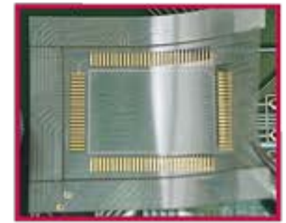
Step 2- Align and adhere stencil to PCB location