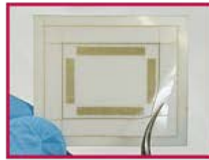
Step 1- Peel backing off the stencil